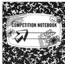
Letters: The Vacuum Called High School