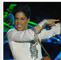
Desert Reign: Coachella as Prince's Castle